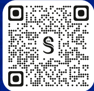
UAE National Students